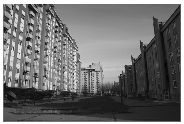
Figure 3: Bratovševa Ploščad.

the inner arrangement of the city" (Mušič, 1960: 4). Town planners saw it as "a self-governing unit, which should accelerate the development of the neighbourhood" (Mušič, 1960: 4). The construction of neighbourhoods was therefore carefully thought out by town planners and architects, whose goal was to construct an urban space that would be able to satisfy all of the residents' functions. As Mušič later argues, the guiding motivation when planning the neighbourhoods was to take the needs of the people into consideration. The basic construction design of these neighbourhoods was to be based upon the consideration of these elements: apartments, public buildings (schools, social and cultural organisations, shops etc.), regulation of traffic (streets and parking spaces) and recreation areas, which were to make use of unexploited green areas and maintain a balance between urban development and nature.