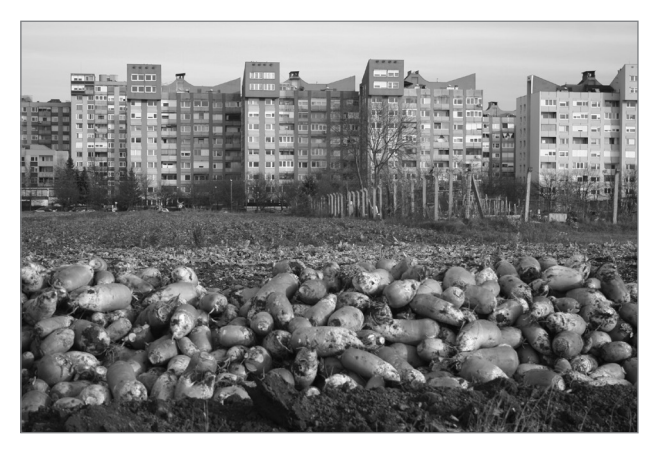
Figure 5: Glinškova Ploščad.

her this area (Ježica) is a city as well as countryside, but that BS 7 is clearly part of the city. The reasons for her perception of Kleče as countryside lie in its distance from city noise and closeness to nature, and as city because it is still close enough to the centre. Her opinion is that her children are city children because they go to the city's Danila Kumar Primary School (in the BS 7 neighbourhood) and spend only their free time in the countryside.