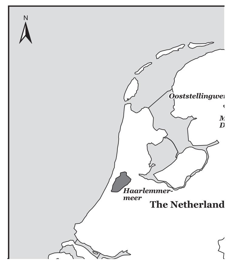
Map 1: The municipalities studied